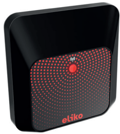
KIO RTLS Anchor