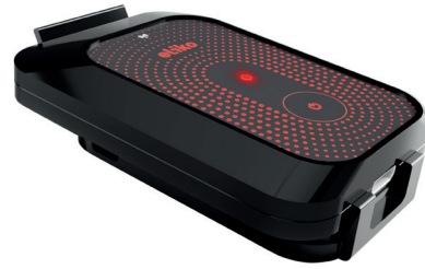
KIO RTLS Tag